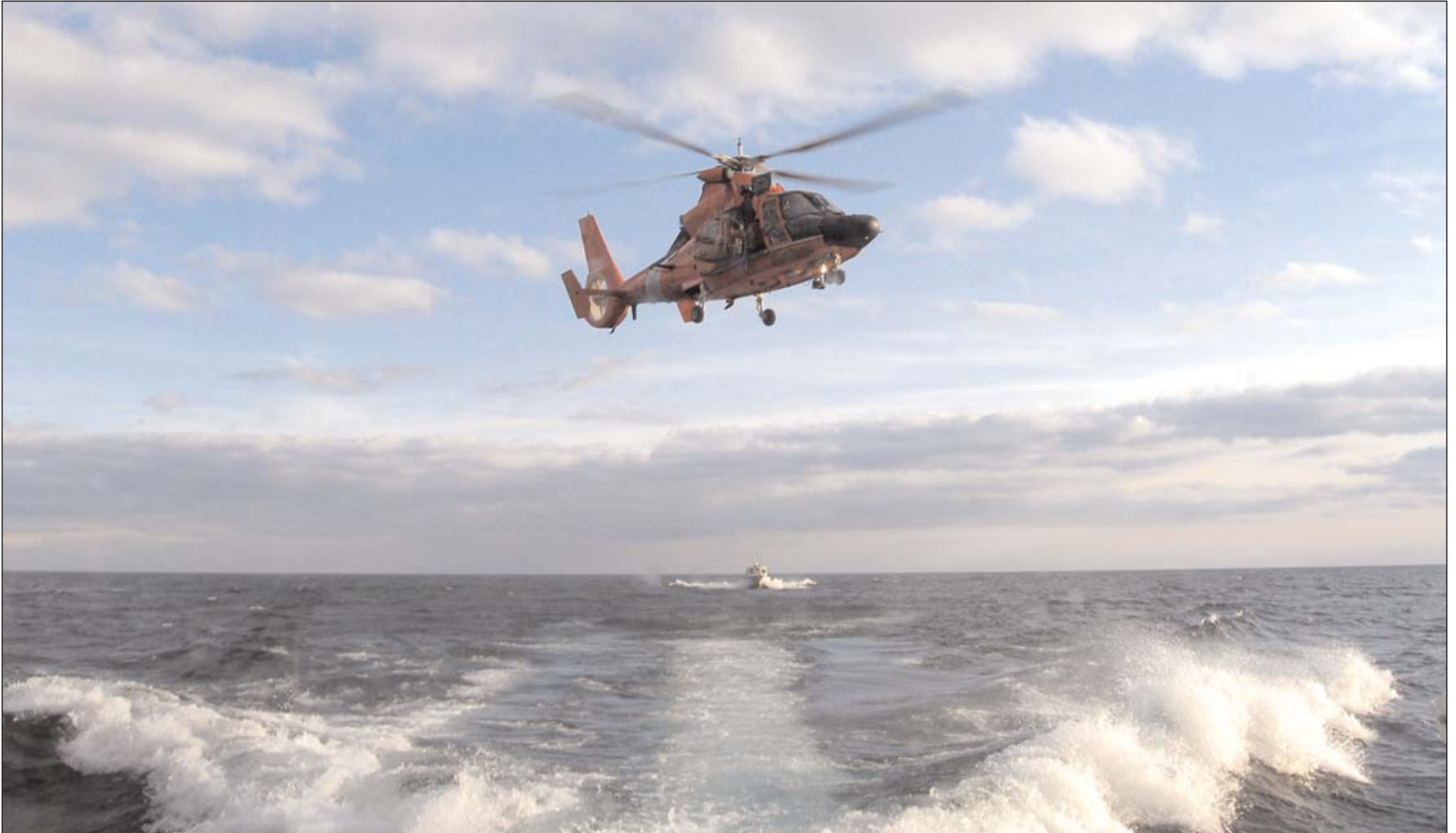
A United States Coast Guard Dolphin helicopter hovers above a Marine Unit vessel during December training. See Page 8